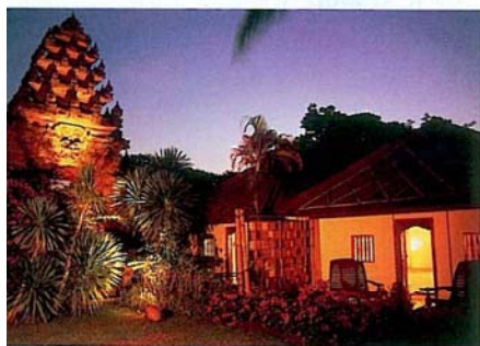
Above: individual beachside villas with private gardens at the Jimbaran Puri Resort Hotel in Bali, Indonesia.