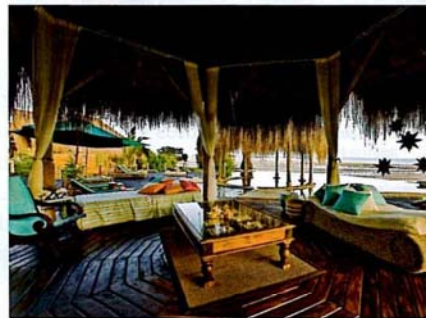
Above: SJ Villas' collection of holiday homes includes the Beach House in Mozambique. Left: Kandinsky's 1937 painting, Groupement – on show at the Centre Pompidou from April 8.

Miami will bring elements of its Manhattan sibling to the fabulous (if somewhat built-up) beach that is Grace Bay, not least a branch of the NYC bistro Bagatelle. Its real selling point, however, is likely to be the “sunning islands” – wooden platforms for lounging on that appear to float on the surface of its palm-fringed 25m infinity pool.